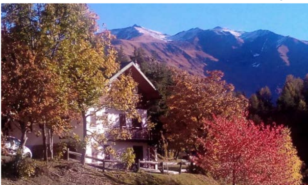
The autumn in our Mediterranean territory