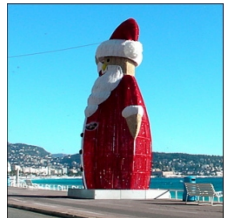
HoHoHo arrival in Nice – Promenade des Anglais !