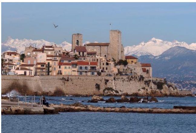
Antibes city in front, snowy mountains in the back