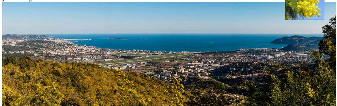
Tanneron hill and the mimosa blooming in front, Cannes city and the sea in the back