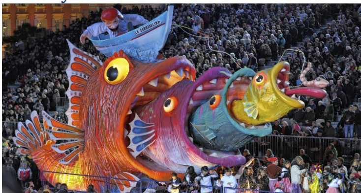
The carnival of the city of Nice