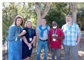
Photo: the four teacher-researchers with the director of ISA

More information on the project: nemedussa.ugent.be