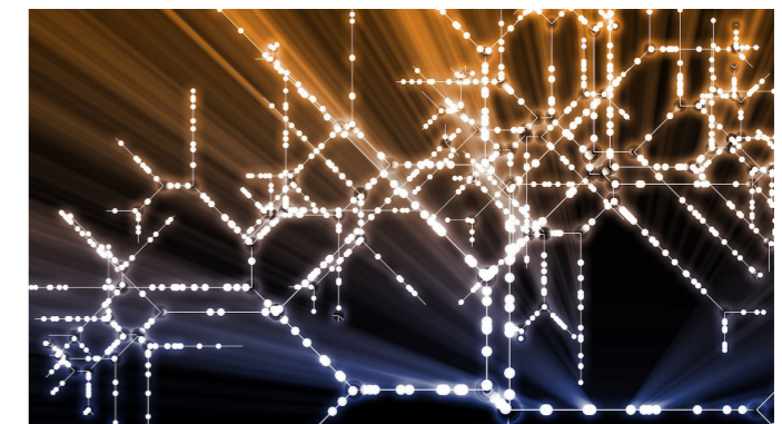
Social networks, the Internet, and urban networks are all complex systems...