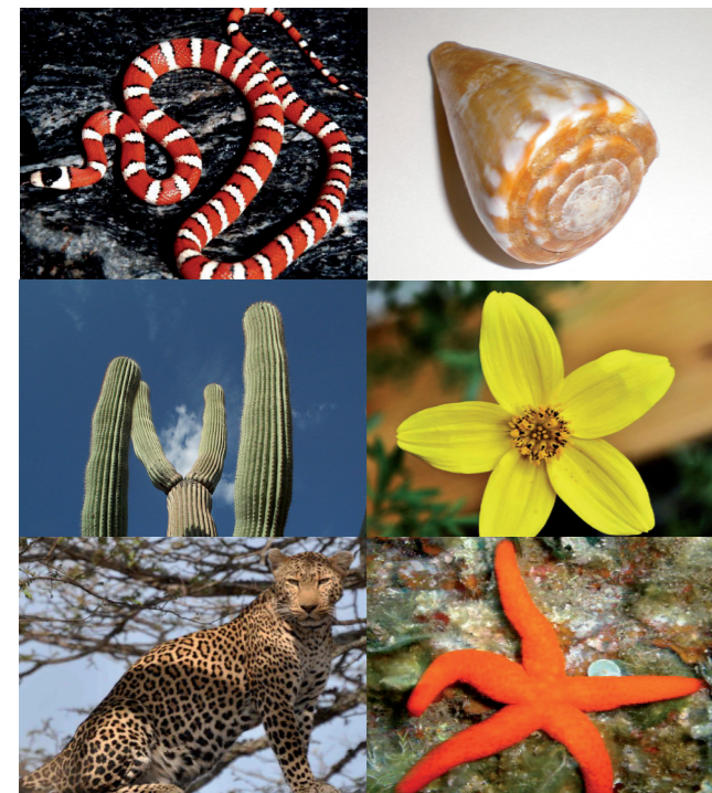
Variety and unity of life-forms

The Complex Systems Academy has the following goals: